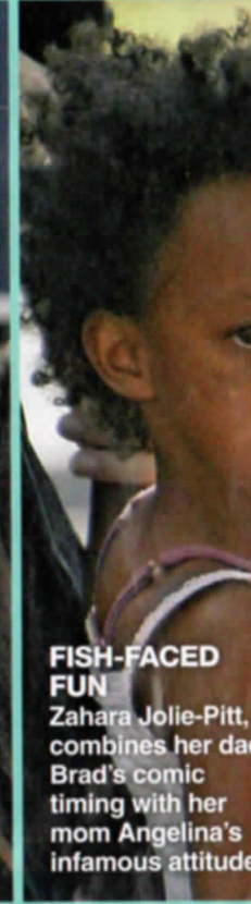
FISH-FACED FUN Zahara Jolie-Pitt, combines her dad Brad's comic timing with her mom Angelina's infamous attitude.